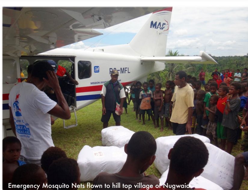
Emergency Mosquito Nets flown to hill top village of Nugwaia