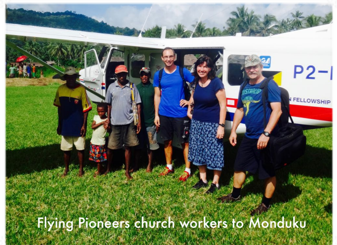
Flying Pioneers church workers to Monduku