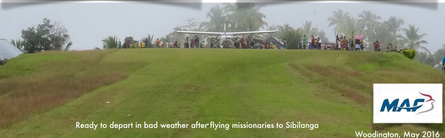
Ready to depart in bad weather after flying missionaries to Sibilanga