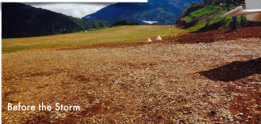
Before the Storm

This was so exciting, that is until the weather turned bad at 10am in the morning and everyone were forced to stay the